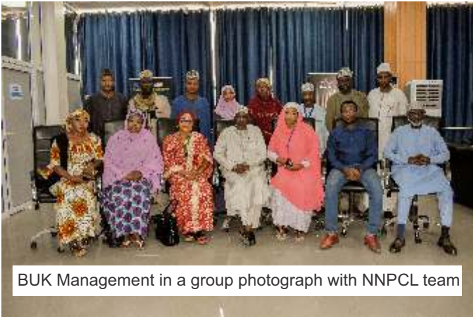
BUK Management in a group photograph with NNPCL team