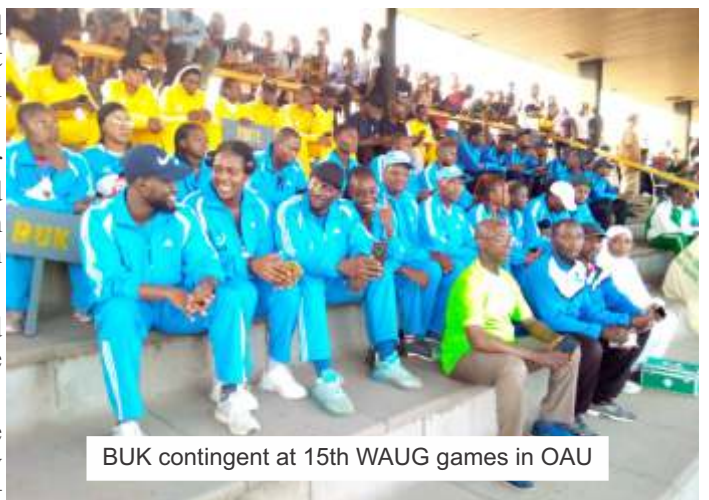
BUK contingent at 15th WAUG games in OAU

He advised that Nigerians should start thinking big and not remain as a consuming nation but a producing nation so as to make life comfortable for all.