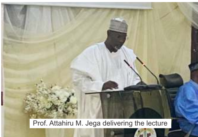
Prof. Attahiru M. Jega delivering the lecture

Professor Jega made the call in a paper he presented at the maiden convocation lecture of the Bauchi State University,