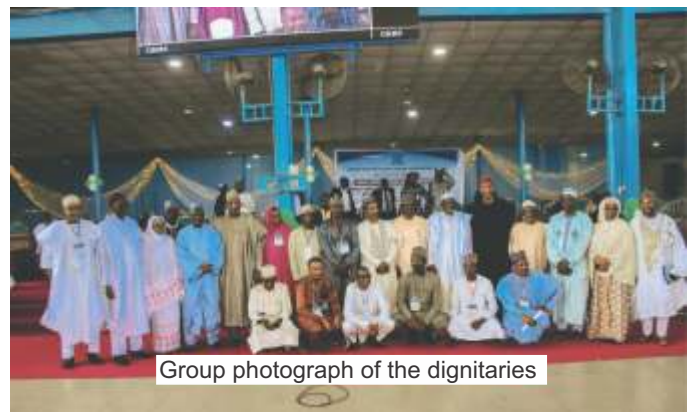
Group photograph of the dignitaries

He said the committee embarked on a rigorous